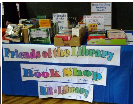
Friend of the Library Table showing Jackie Hough's signs